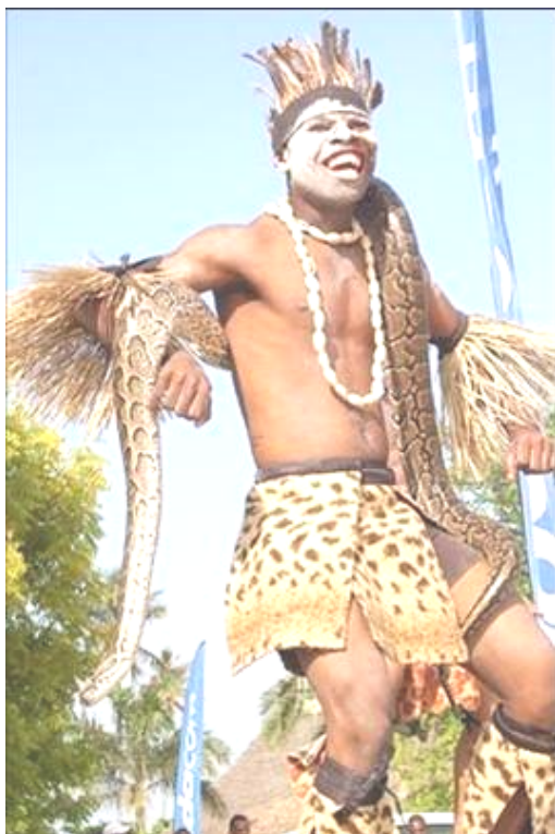
A traditional Kurian male dancer

This statement tallies with the field data collected in Kurian post-war areas in Tanzania. From the respondents' data, we derived a list of vocabularies-which are mostly taboo words or insults (see the names given below)-that are highly provocative when used in tense pre-war situations. When two warring sides exchange such words/discourse, the end result would be a beginning or escalation of war.