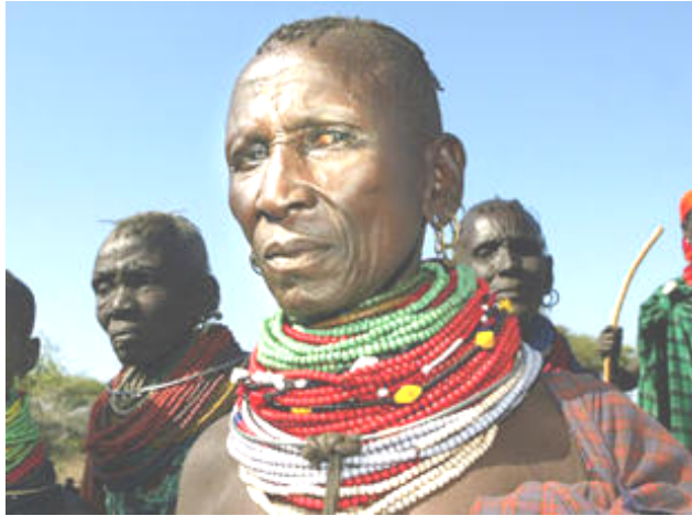
A Kurian woman in her traditional wear

This is noteworthy in that attitudes are built within the vocabularies/words of our languages. Culture in turn finds expression in language. Most of these lexically loaded terms inform some cultural activities such as circumcision of both girls and boys.