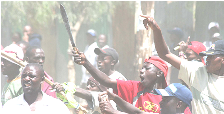
Young men use all kinds of crude weapons in Kurian wars

Irininyya: A lady who becomes pregnant and delivers a baby before undergoing circumcision/FGM. Even though such cases exist in the Kurian society, it is not culturally acceptable to call women by that term. A conflict may rise when you insult someone's mother, wife or sister using such terms. Since it's a taboo word that is laced with sarcasm, the affected normally react violently hence violence.